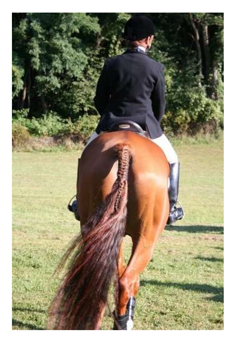
Metamora Hunt Photos