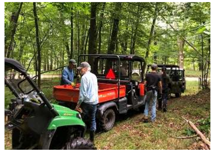
The Metamora Hunt gathers groups of our Members and Supporters most Saturday mornings to maintain the private equestrian trails in the Metamora Countryside. We trim brush and remove fallen trees from the trails with the Landowner's permission.

This is usually just a couple of hours of fun effort for a great cause. If you are interested in joining us for trail trimming please contact one of our leaders. Their contact information is at the top of the left hand column of this newsletter.