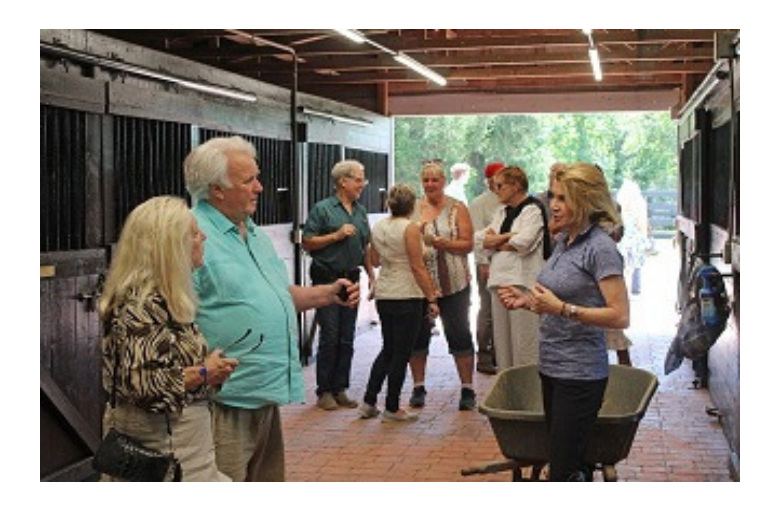
Tickets for adults are $25 and will be available the day of Tour beginning at 11:00 am at the Metamora Hunt Kennels on Barber

The Stable Tour makes a perfect activity when entertaining weekend guests or attending a nearby horse show! The Tour includes six stables that display a variety of styles and equine disciplines. If you have friends or family that may be interested in the Stable Tour, please forward this to them.