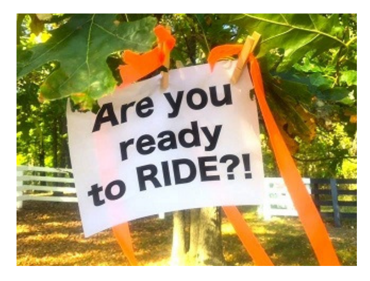
For entry forms, liability release, maps, and additional information contact: www.metamorahunt.com