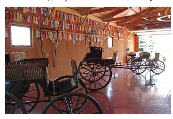
Six showcased stables. Self-guided format. Metamora Hunt volunteers will be on site to direct you. All showcased stables are within a short drive of the Metamora Hunt kennels at 5614 Barber Road, Metamora, MI 48455.

The Stable Tour makes a perfect activity when entertaining weekend guests or attending a nearby horse show! The Tour includes six stables that display a variety of styles and equine disciplines. If you have friends or family that may be interested in the Stable Tour, please forward this to them.