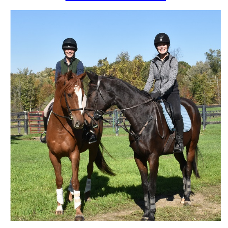
Riders will be started after registration in teams of 2-4. If you do not have a team, we will be happy to make one for you. Ribbons will be awarded to 1st. through 6th. place teams in both the Fastest time and the Optimum time divisions.